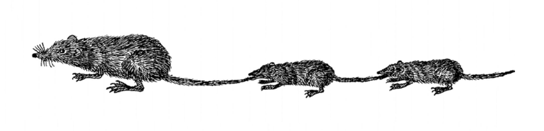
Figure 2. Part of the family of seven Pacific Water Shrews travelling together holding tails along a Beaver pond at Davidson Creek, British Columbia Sketch by Glenn R. Ryder, 26 June 1977.

The Davidson Creek habitat was primarily in a riparian stand of mature black cottonwood ( Populus balsamifera ssp. trichocarpa ), unlike other forested habitats reported for the species' range in southwestern British Columbia (Nagorsen 2006).